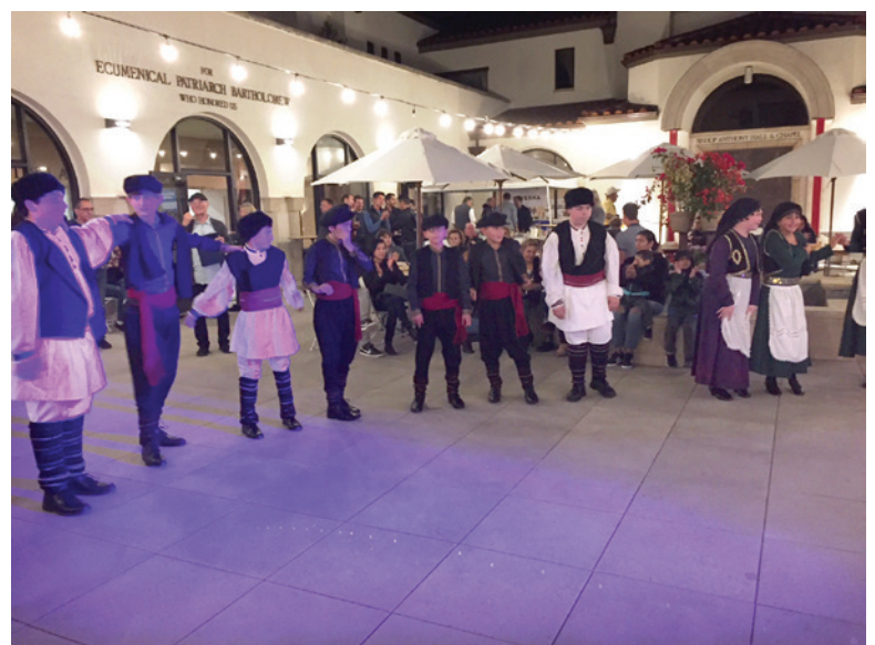
to see more photos, turn the page