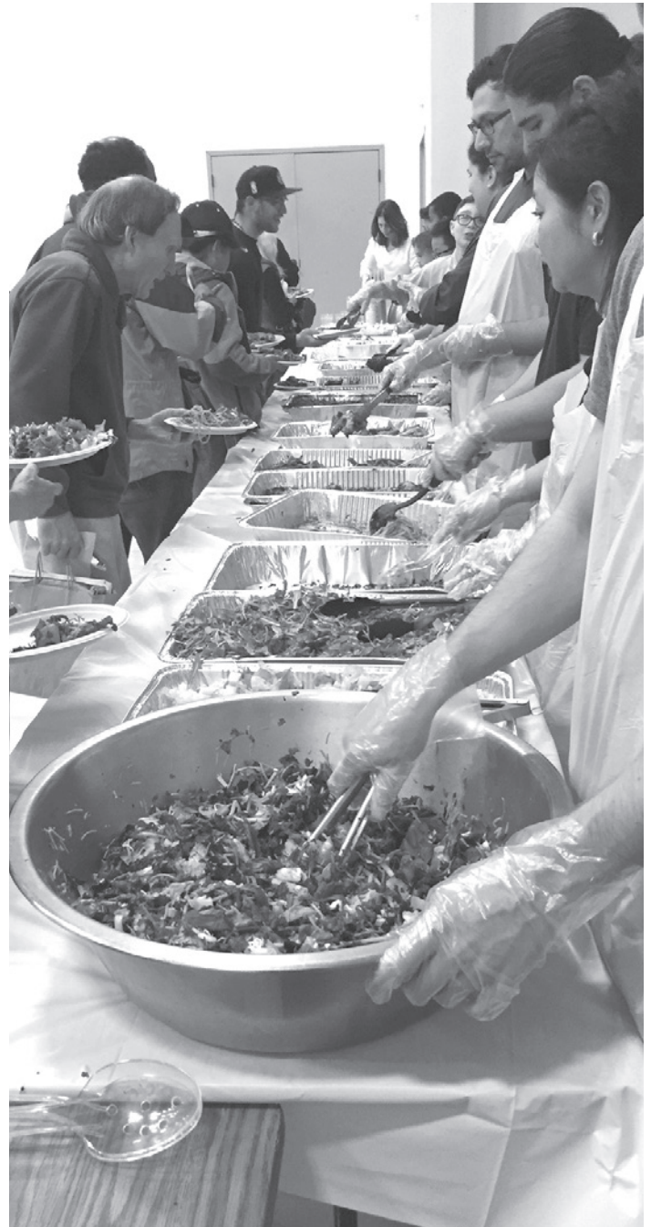
From the March 19 Community Kitchen: Young adults, joined by parishioners, feed the hungry.