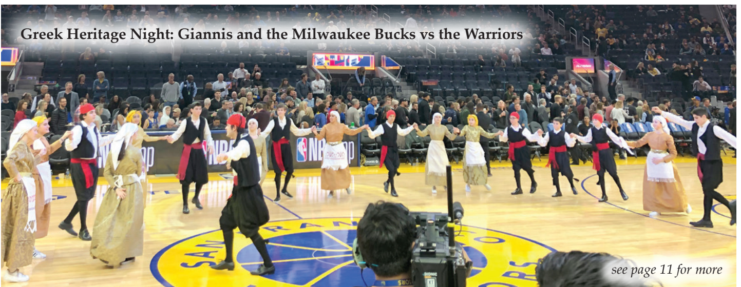
see page 11 for more