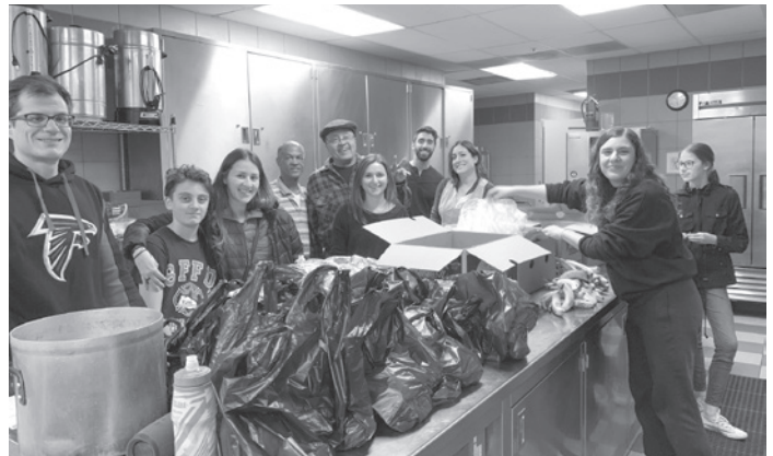
Members of Annunciation Cathedral's GOYA (Greek Orthodox Youth of America) prepare to-go bags at the December Community Kitchen. Some 130 guests were served a hot meal.

In February Community Kitchen will take place on Tuesday, February 18, 5:30 p.m. for set up and 6:30 p.m. for serving. We look forward to your participation.