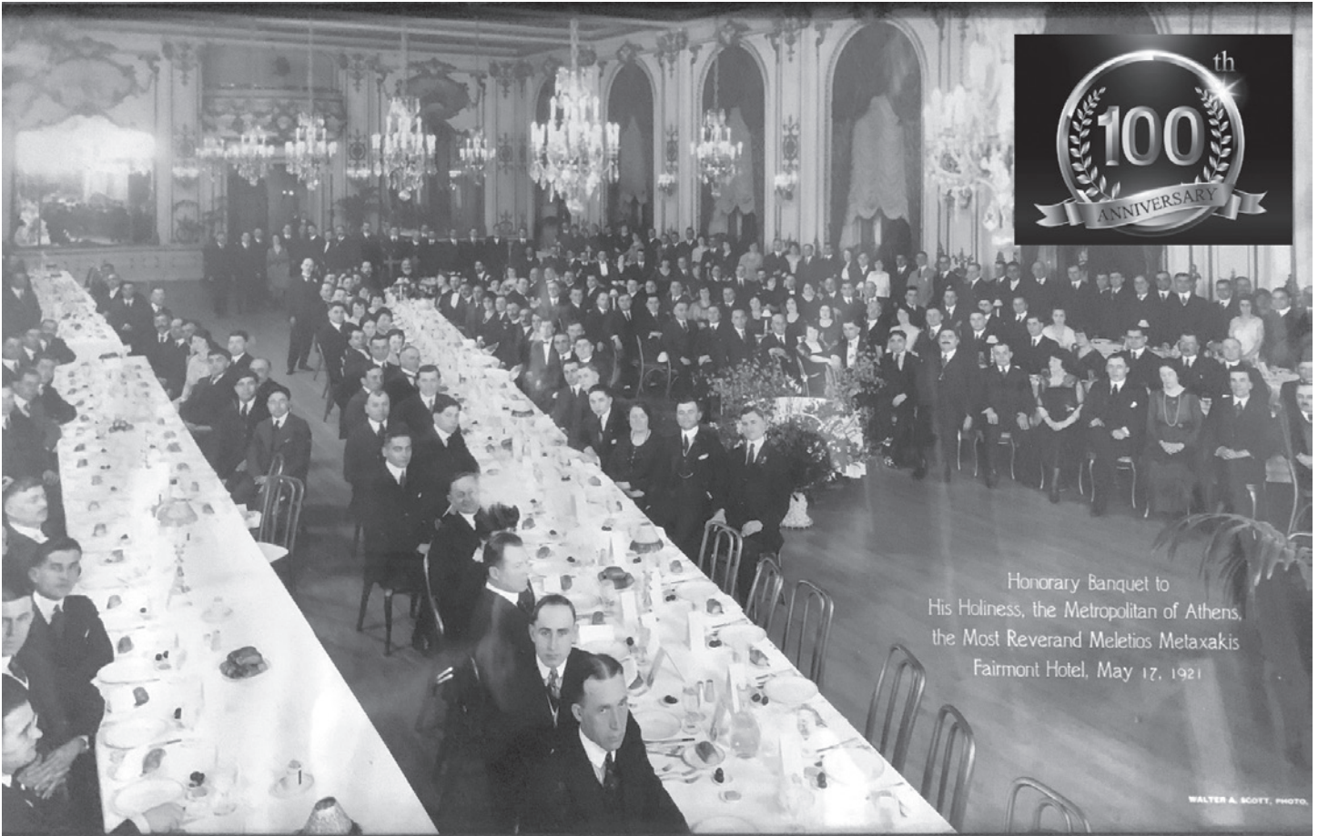
The above photograph was taken nearly 100 years ago, in the grand ballroom of San Francisco's Fairmont Hotel. It was taken on May 17, 1921. At this banquet, the Cathedral was created.