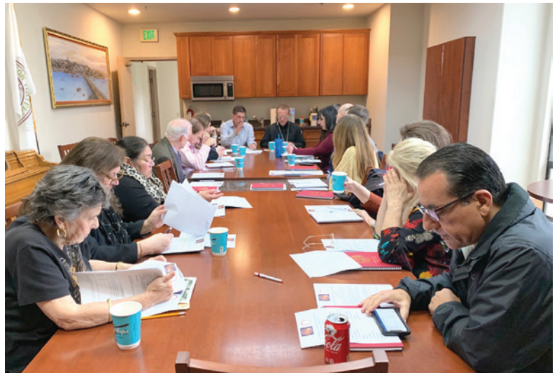
First 100 th anniversary meeting. Many more to follow.