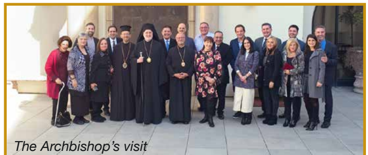
The Archbishop's visit