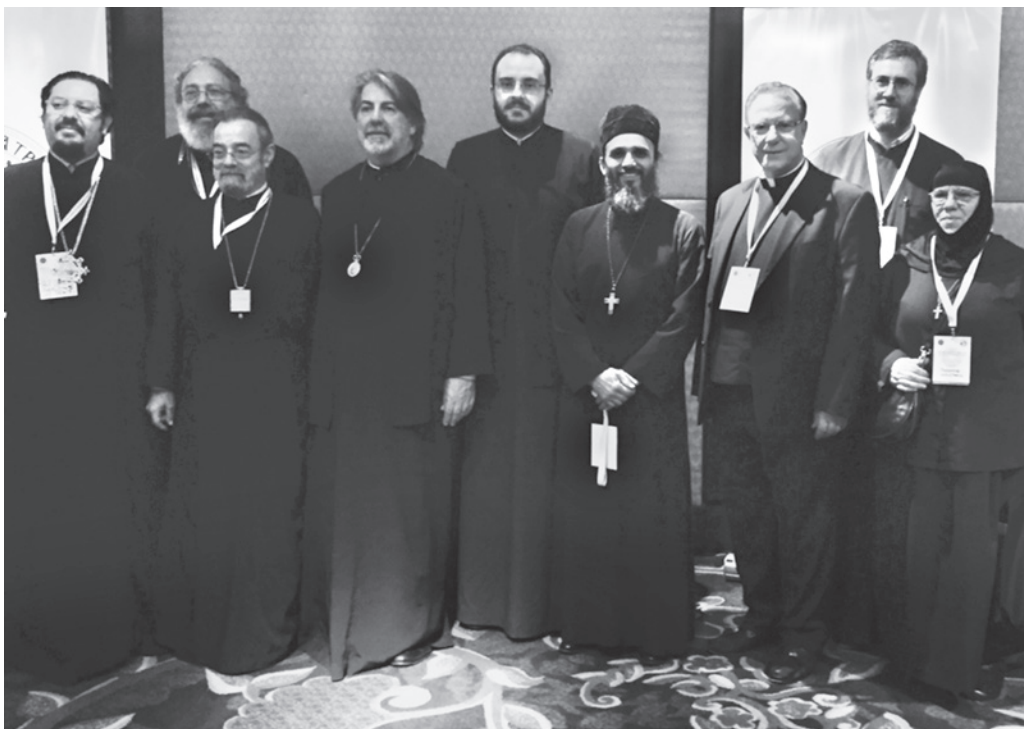
Members of the Orthodox clergy who attended the forum in Buenos Aires. Below, is a press released following the forum

Under the auspices of the Ecumenical Patriarchate, a second international forum on modern slavery convened in Buenos Aires, Argentina, May 5-8, 2018. This forum, entitled Old Problems in the New World, was cosponsored by the Greek Orthodox Archdiocese of Buenos Aires and South America, and the Patriarch Athenagoras Orthodox Institute (Berkeley, California). The purpose of this gathering was to bring together distinguished practitioners, policymakers, theologians, and scholars, from within Latin America and other parts of the world to explore the myriad dimensions of the scourge of modern-day slavery.