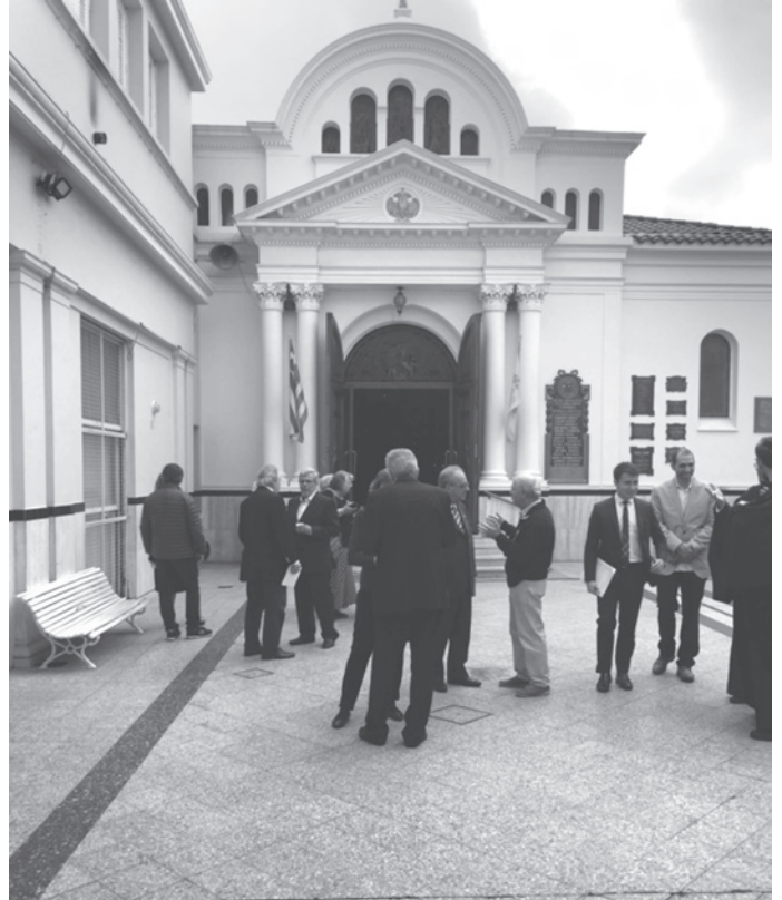
After Liturgy, in the courtyard of the Dormition Cathedral of the Metropolis of Buenos Aires.

Halki Theological School awaiting its re-opening #ReOpenHalkiNow