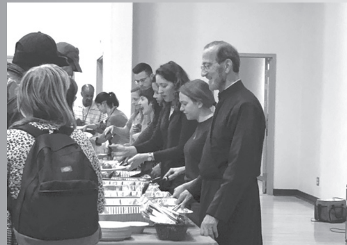
Bless the hands that have prepared this food.

The Cathedral's Community Kitchen, which began under the name "Soup Kitchen," operates the third Tuesday of every month. The volunteer work involves food prep, cooking, hall setup, serving the meal and—so important—cleanup. We also have a food pantry, so a few awesome volunteers come early to bag up canned/non-perishable goods for our guests to take with them. Some volunteers arrive earlier, but the typical timeframe is 5 p.m. to 9 p.m. Shown above are just some of our Young Adults, who spearhead the Community Kitchen ministry. Won't you join them? Following each Community Kitchen, after cleanup, the Young Adults gather in the second-floor conference room for wine and cheese. They get to know one another better. They welcome new members. They address topical issues. And, of course, they plan for the following month's Community Kitchen. In November, the Young Adults teamed up with the Cathedral Ladies Philoptochos and turned out a Thanksgiving feast! In December, the theme was Christmas. The Metropolis Young Adults contributed gift cards, which, in turn, were handed out to our guests. In April, Community Kitchen will take place on Tuesday, June 19, and then on Tuesday, July 17. Our guests count on us to provide them with a hot meal, and fellowship. May we, in turn, count on you? Once again, that's June 19 and July 17, 5:30 p.m. for set up and 6:30 p.m. for serving.