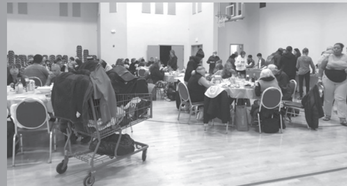
Our guests know: Community Kitchen is the third Tuesday of every month.