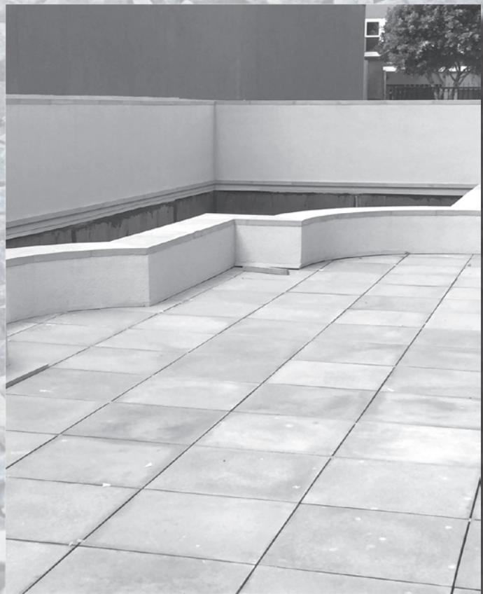
Pavers being laid along the south wall and garden