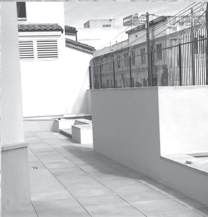
Pavers being laid behind the Cathedral, along the eastern wall