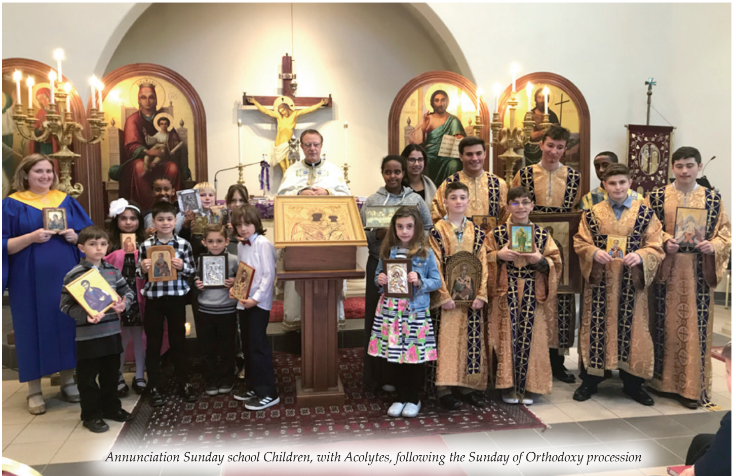
Annunciation Sunday school Children, with Acolytes, following the Sunday of Orthodoxy procession

NON-PROFIT ORG. U.S. POSTAGE PAID SAN FRANCISCO, CA PERMIT NO. 1734