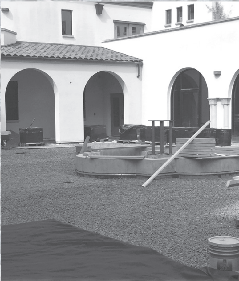
The laying of the courtyard pavers has begun. Several inches of crushed rock is being laid over the waterproofing membrane and under the pavers, to facilitate drainage. The last outdoor item which will be tended to is the Courtyard fountain.

See the photos that follow. They depict the laying of the pavers throughout the property, as well as the planter and other walls along Valencia Street. It seems, now, that construction is continuing at a fast pace.