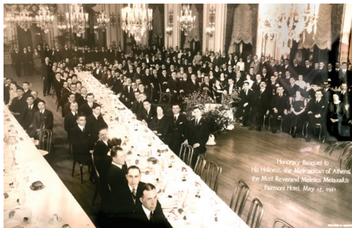
Photograph of the May 17, 1921 banquet, where the Cathedral was founded by acclamation, as referred to in the May 19, 1921 minutes.