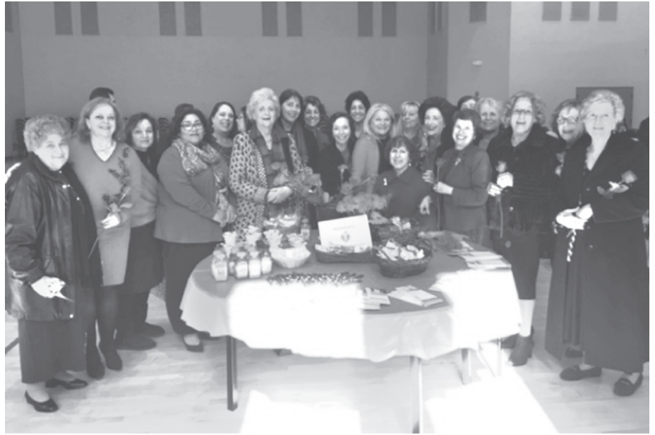
Ladies Philoptochos showing support for Go Red Sunday