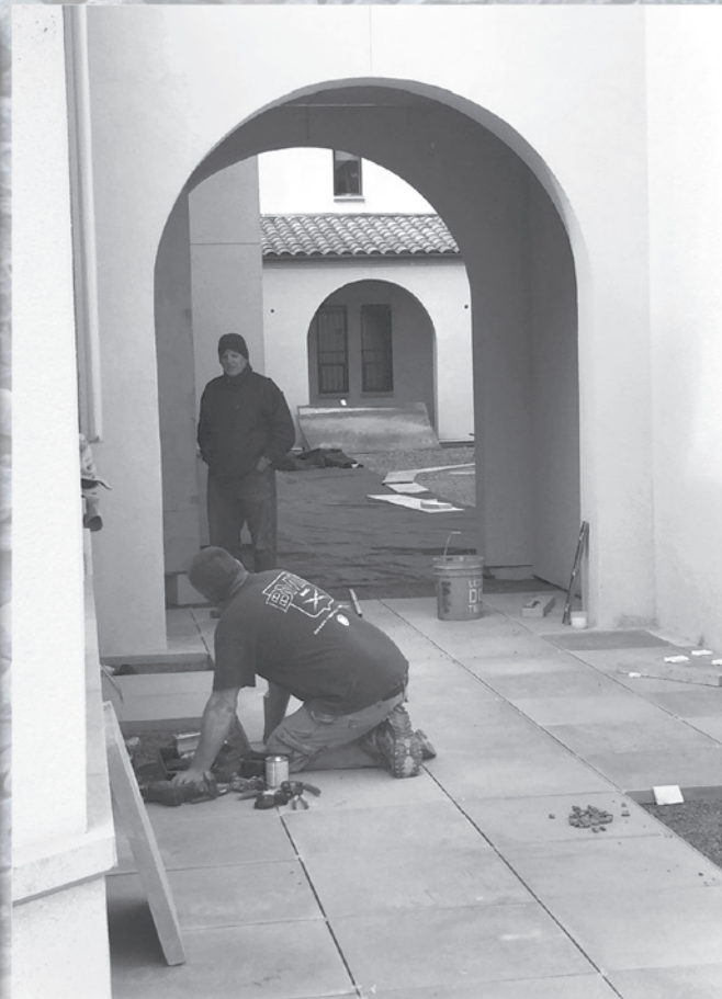
Pavers being laid between the western garden and the courtyard