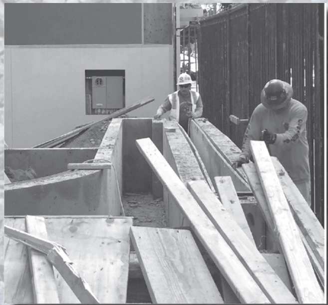
The wall and fence footings along Valencia Street being constructed. This will enable the fence to be pushed back and positioned behind the new sidewalk, which is being poured as this issue of the Herald is being delivered to you.