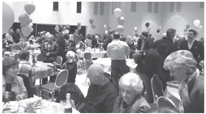
Festive times at the crab feed. A good time was had by all.

Please join us as we build a community of faith, respect and kindness that is safe and welcoming for all.