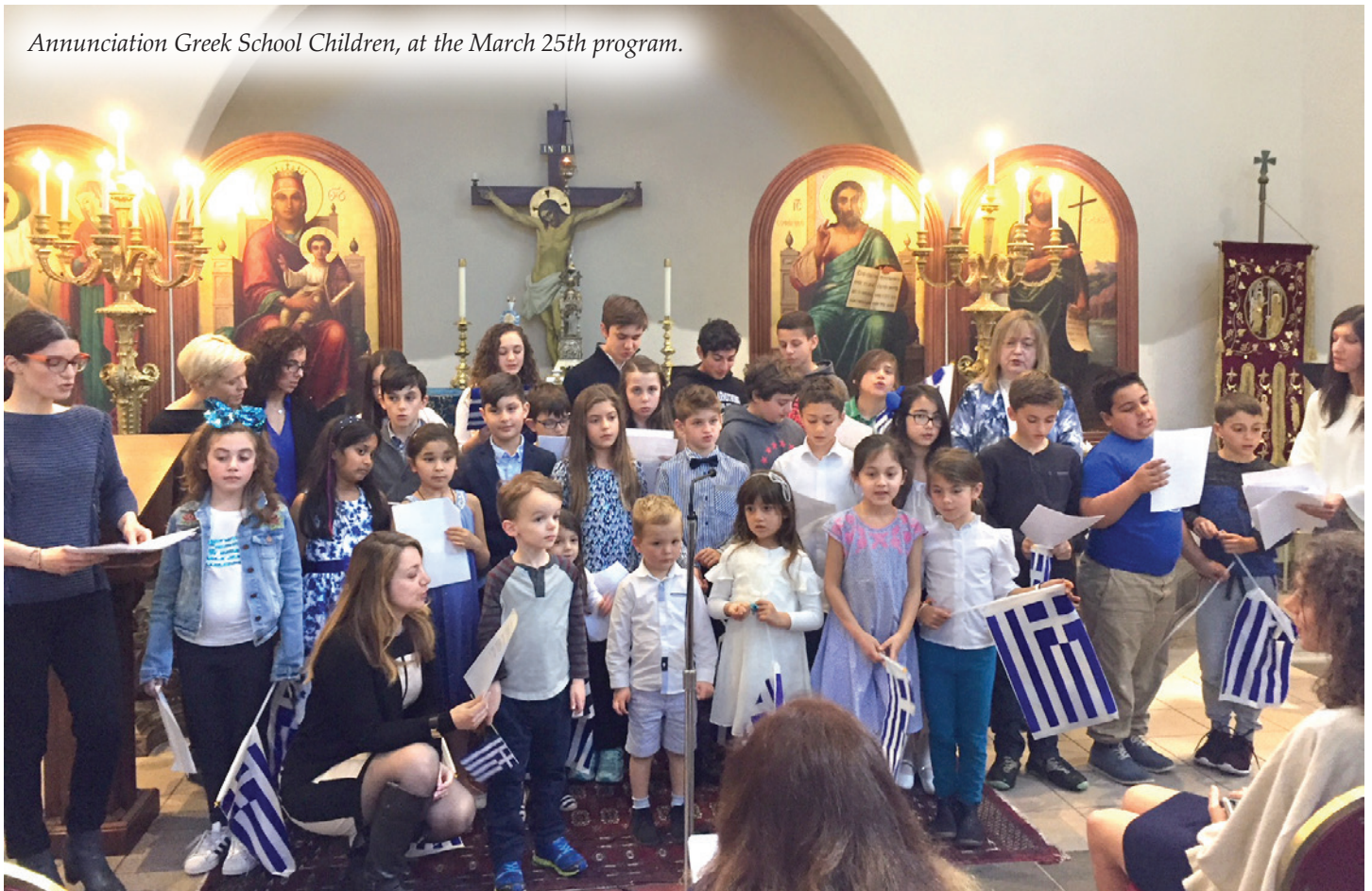
Annunciation Greek School Children, at the March 25th program.

NON-PROFIT ORG. U.S. POSTAGE PAID SAN FRANCISCO, CA PERMIT NO. 1734