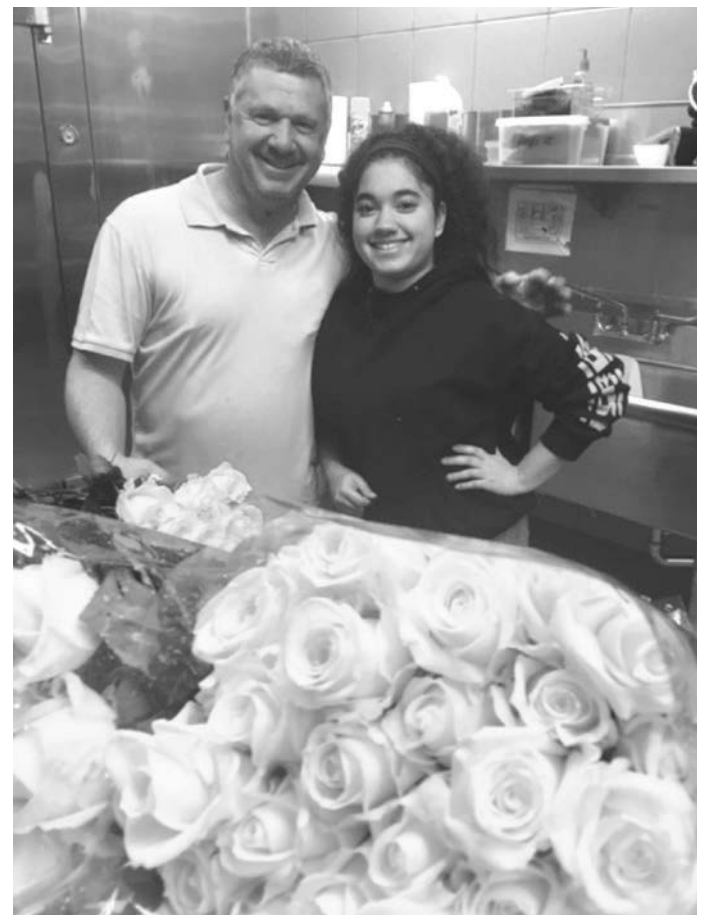
Father and Daughter: The dynamic Pappas duo