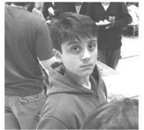
Thank God for our Young Adults!