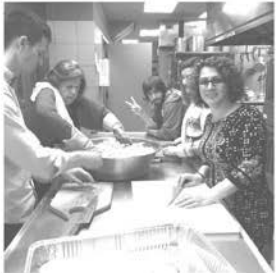
Bless the hands that have prepared this food.