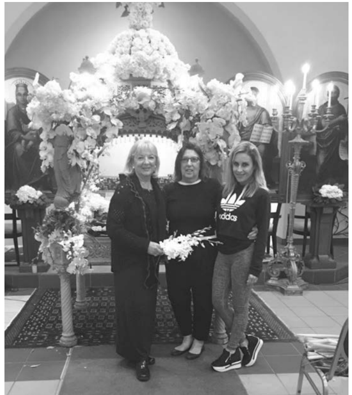
The Epitaphios each year is beautiful and unique, thanks to the efforts of our faithful volunteers