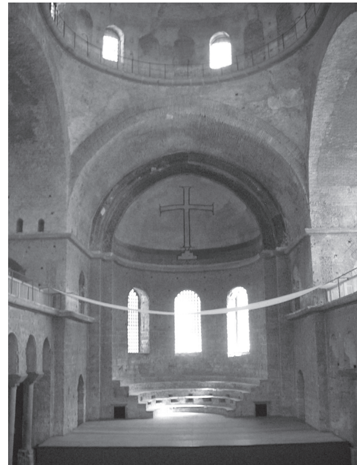
Haghia Eirene, nave towards the apse

After my payment I was then accompanied by another man and we walked over to the church, went in, and I was immediately impressed to tears and overwhelmed. Haghia Eirene has always been one of my favorite churches, but in person it is far more powerful and greater than any photos I have seen. I took over 100 digital photos using my inexpensive digital camera and probably at least 40 film photos with my old film camera, which has much better lenses than my digital camera and wider angle lenses. I will have the film scanned to jpg's. I was in Haghia Eirene for over an hour and I was completely alone in the church. I think the guy who took me there went back to his office and