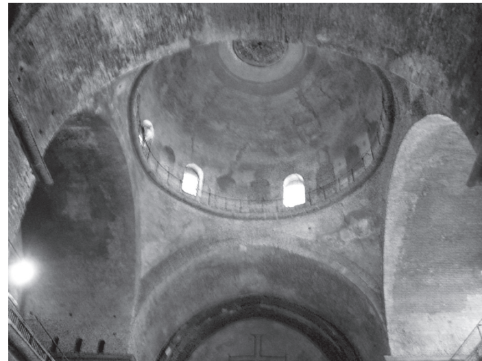
Haghia Eirene, domes and vaults

left me alone, because in the six page form I filled out to gain access to the church I said I needed at least an hour. He reappeared after an hour, but did not push me to speed things up and left me alone to finish. The experience was definitely one of the highlights of my life. Being in such a great building with no tourists, all alone, to experience it and photograph it and walk around it at my own pace in exactly the way I wanted to, was something I will never forget as long as I live. Attached are a few previews. [Four views of Haghia Eirene were forwarded, which we have reprinted. Note: The Ecumenical Patriarchate was moved from Haghia Sophia to Haghia Eirene when the Ottomans took Constantinople in 1453. Then it was moved again, to the Church of the Holy Apostles, a fourth time to Panaghia Pammakaristos and, finally, to St. George, where it is located today. Haghia Eirene was never turned into a mosque. It was used to store artillery. Today it is used for mosaic restoration.]