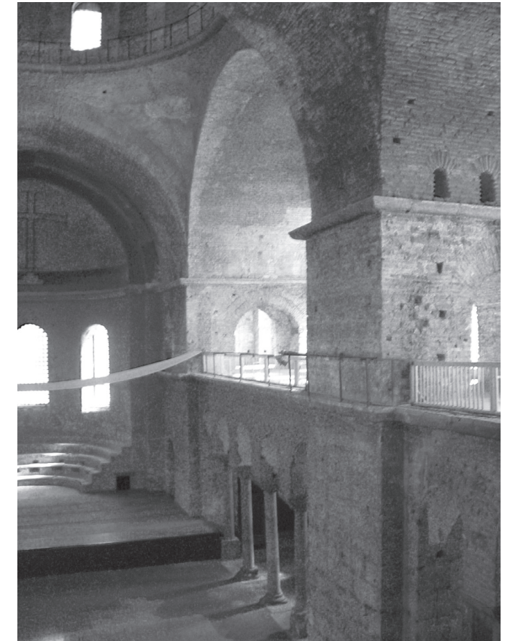
Haghia Eirene, nave towards the apse