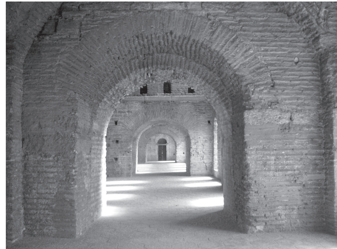
Haghia Eirene, east second floor arcade