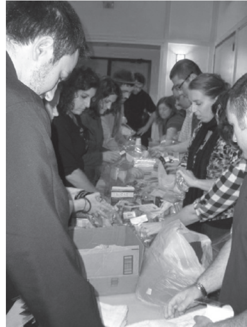
Youth gathered for the Bay Area community service project, which consisted of preparing kits for Haiti through IOCC