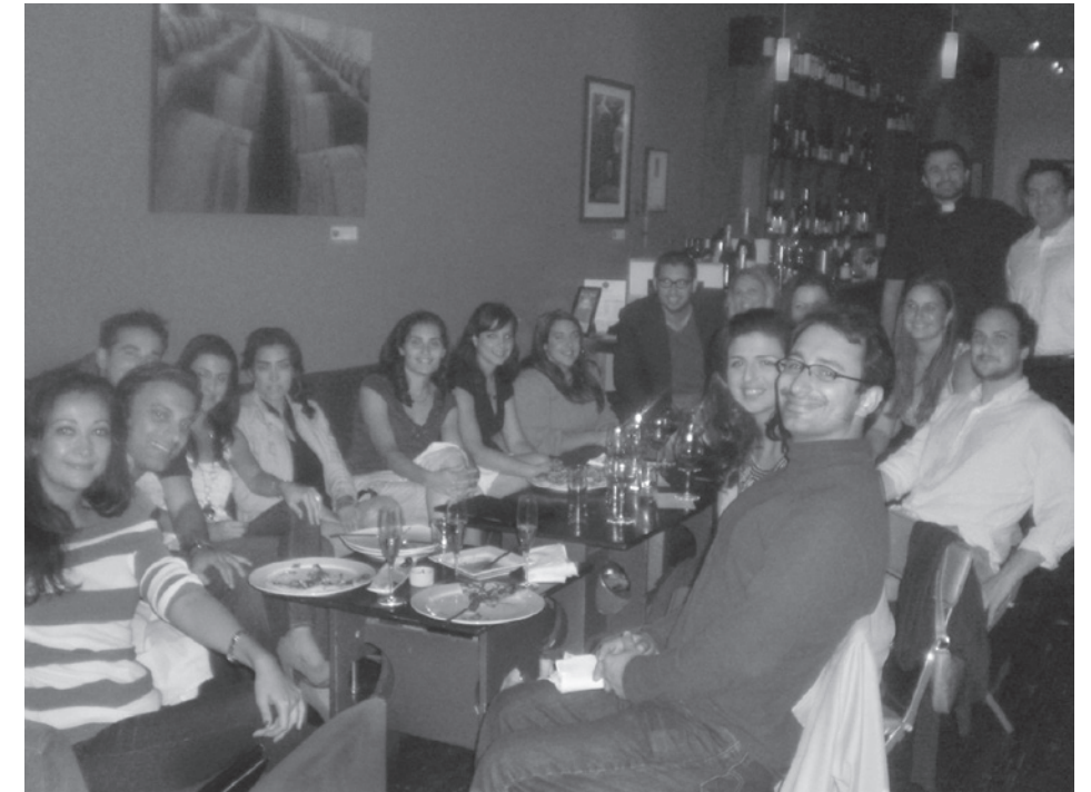
A night out, with good food and fellowship, a monthly tradition.

Practice for the 2010-2011 Junior Varsity season will begin on Wednesday, November 3, at 7 p.m.. Boys and girls, ages 7 to 14, are invited to come to down to the gym that night for registration and for our first practice. An information flyer was distributed to youth during the Halloween luncheon held on October 31 st . Players' parents must be members of the Cathedral in good standing. Players and coaches are required to attend the Divine Liturgy at the Cathedral regularly, with players enrolled in the Cathedral's Sunday School program.