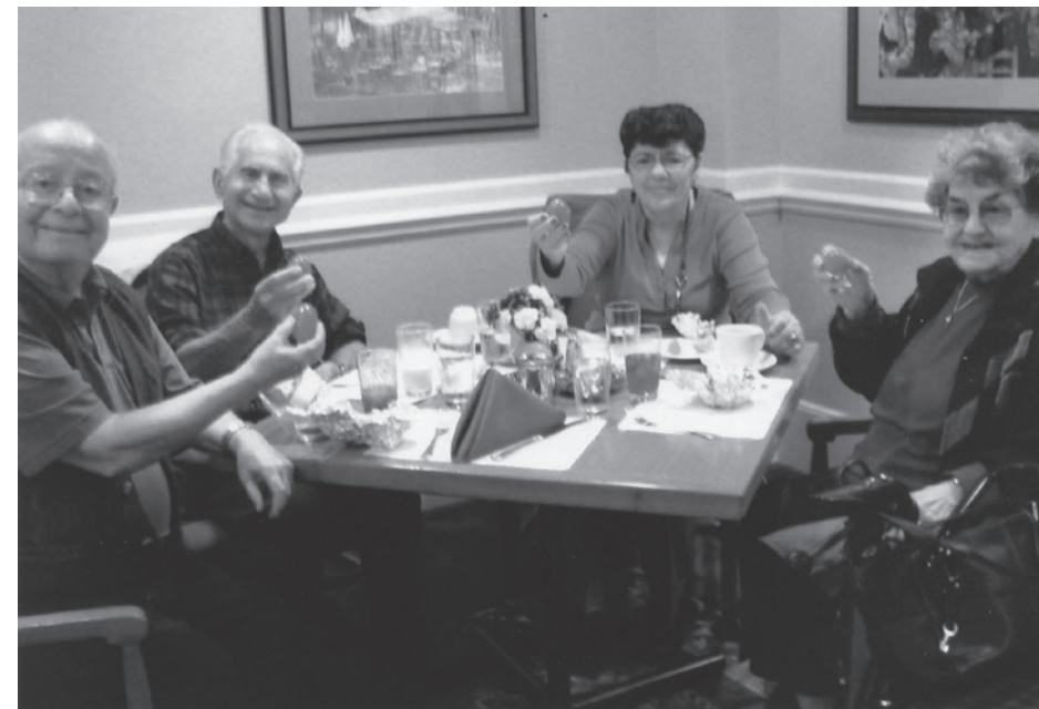
Community Link members visiting parishioners in an area convalescent facility.