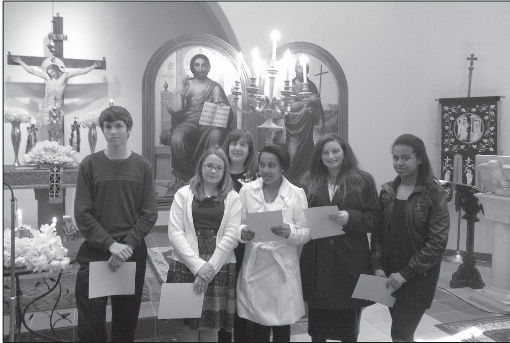
Our Oratorical Festival Participants who competed in 2012. Congratulations to each of them!

Easter as they do in Greece, we can still feast with family during Bright Week, go out to dinner with our families or any other kind of celebration we can think of, all the while chanting Χριστός Ανέστη in our hearts and with our voices. As we celebrate the love that the King of kings, our Lord and our God came to personally bring us, let us remember: "It is the day of the Resurrection; let us then make ourselves resplendent for the festival and embrace one another... Christ is Risen from the dead, trampling death by death, and bestowing life to those in the tombs."