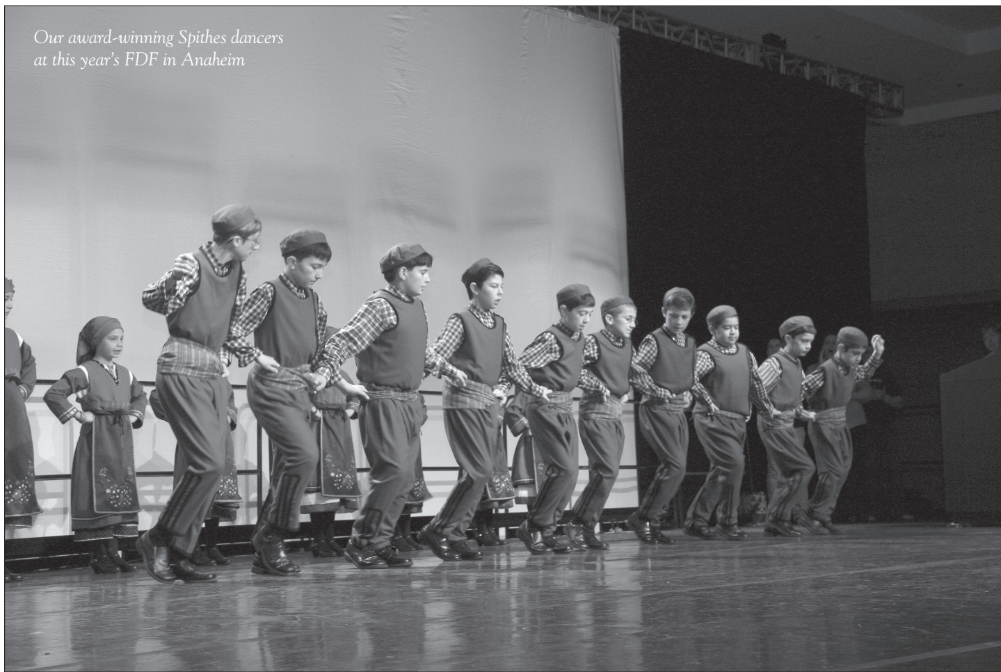
Our award-winning Spithes dancers at this year's FDF in Anaheim

*** GOYA (Greek Orthodox Youth of America) is open to all youth grades 7-12, and is typically held the third Monday of the month ***