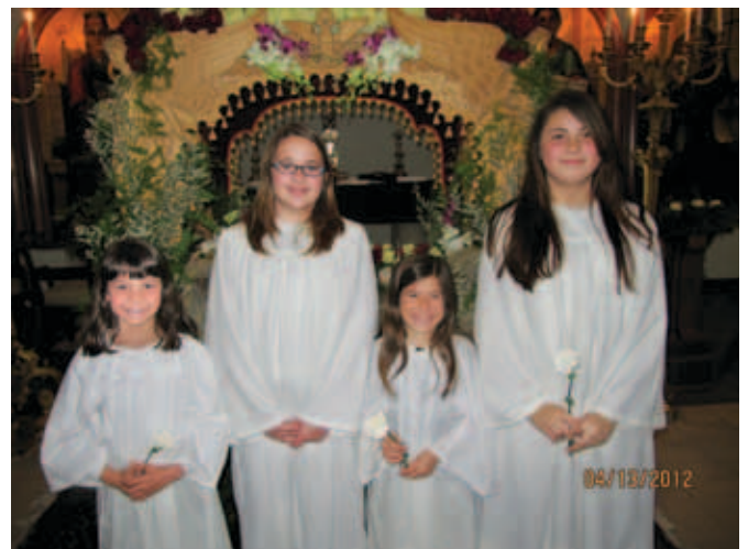
Some of this year's angels!