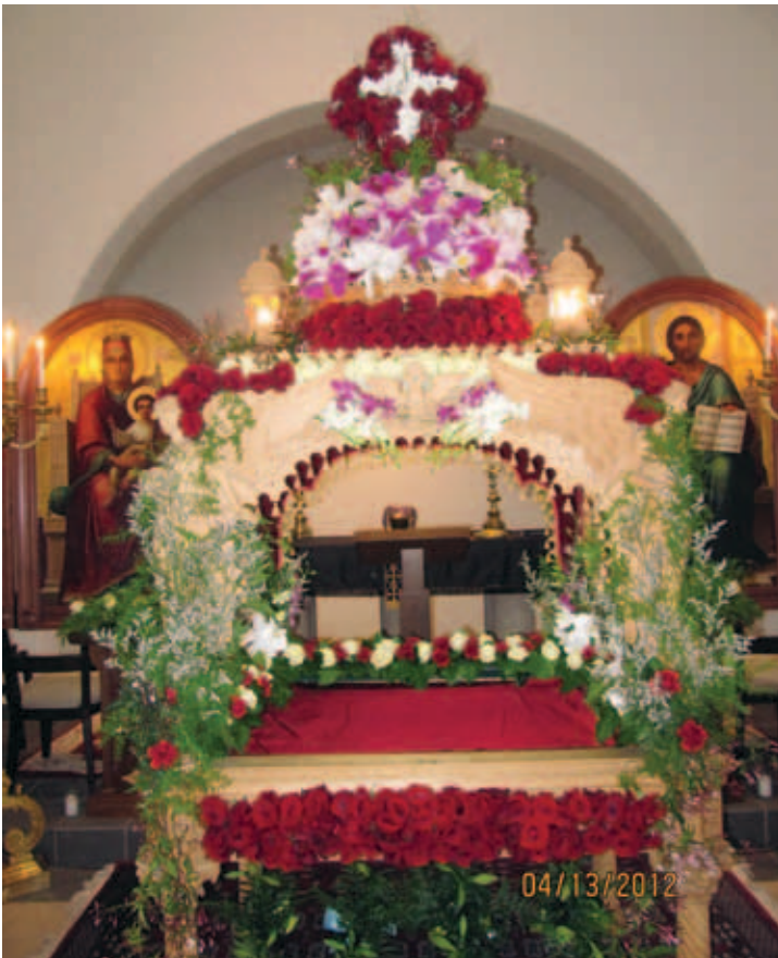
This year's beautifully decorated kouvouklion.