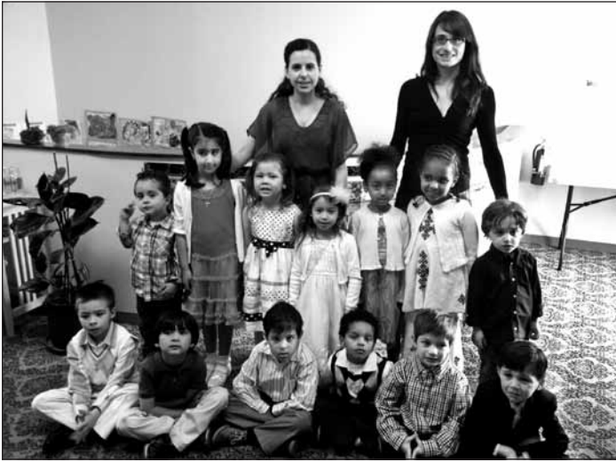
Pre-School and Kindergarten class