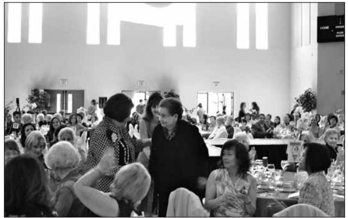
The Mother's Day Fashion Show and Luncheon in the Korinthias Hall

So join Philoptochos for a delectable breakfast buffet that you won't want to miss. Check the accompanying flyer for more info.