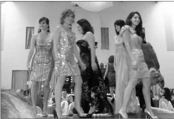
Some of our lovely ladies looking very chic

We look forward to everyone joining us on Father's Day, Sunday, June 17, 2012 as we honor two special fathers who represent all fathers on this day.