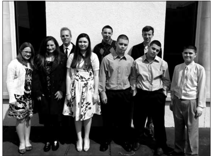
Our 7th and 8th grade class