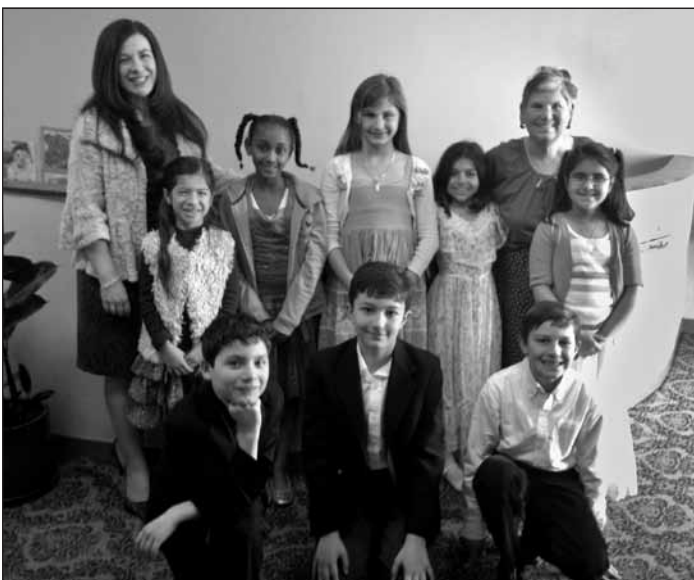
3rd and 4th grade

“Pray for the salvation of others as you would pray for your own salvation.” - St. John of Kronstadt