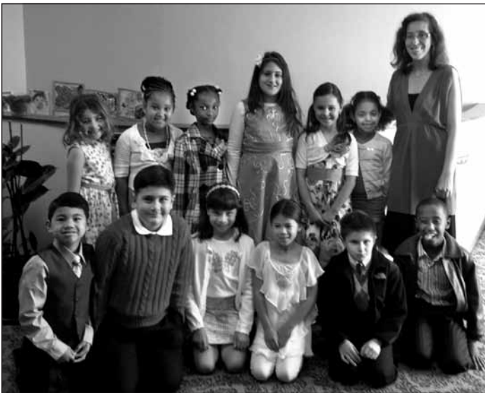
This year's 1st and 2nd grades