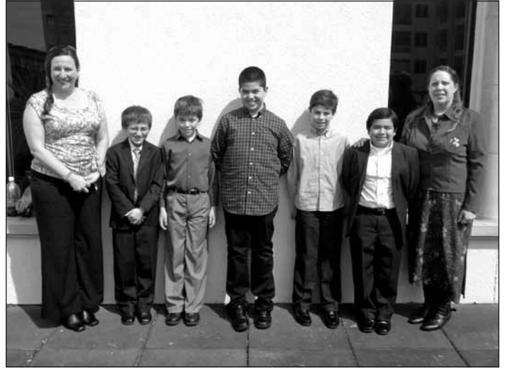
The 5th and 6th grades