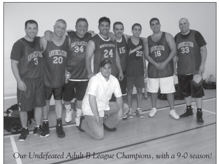
Our Undefeated Adult B League Champions, with a 9-0 season!