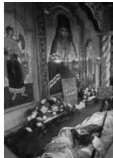
St John Maximovitch

the relics of the saints is a natural outcome. The grace of God that is present in the saints’ bodies during their lives remains active when they die, and God uses such bodies as channels of divine power and as instruments of healing. In some cases, the bodies of the saints have been miraculously preserved from corruption; but the reverence and veneration of the relics of the saints is present even when this has not occurred.