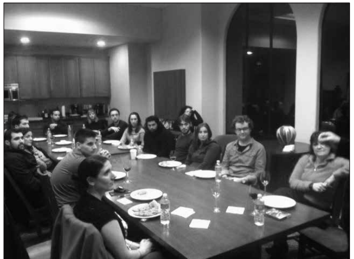
January 2013 Discussion