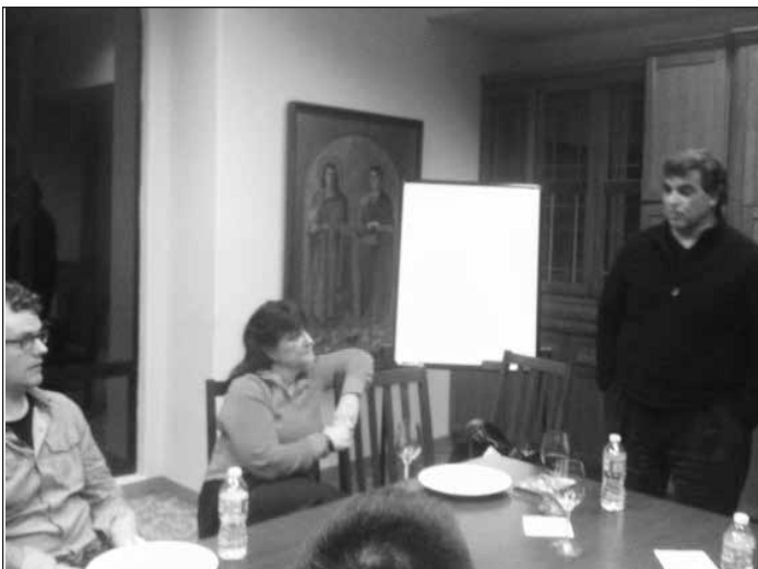
January 2013 Discussion