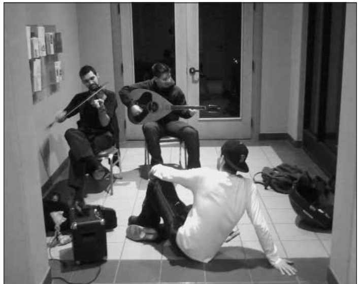
Rizites Jam Session

“The spirit of this world makes wolves out of lambs, while the Spirit of God makes lambs out of wolves.” – St. Nicholas the Serb