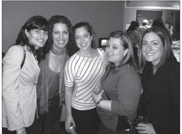
Some of our Young Adult ladies enjoying the evening at an event in February

Parishioners in good standing (that is, those who are ecclesiastically in good standing with the Orthodox Church, as defined in the Archdiocese Regulations, and who have met their stewardship obligations to the Cathedral) may participate in the Parish Assembly. Quorum requirements, as defined in the Parish By-Laws are: 75% of the Parish Council (i.e. 12 out of 15 members), an equal number of other parishioners in good standing, plus the Dean of the Cathedral or, if fewer than 12 members of the Parish Council are present, then 75 parishioners in good standing, plus the Dean of the Cathedral.