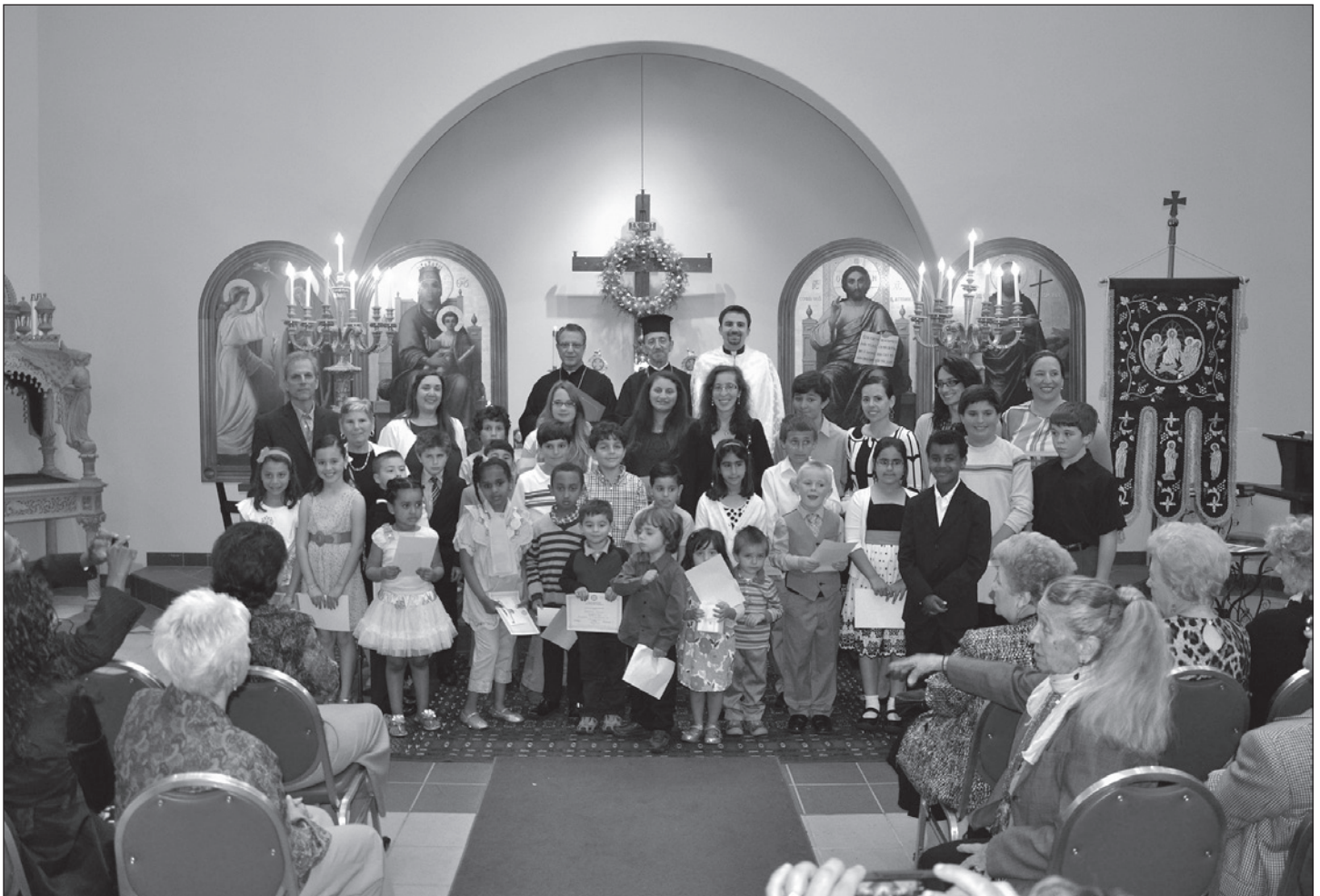
Many of our Sunday School students and faculty at Sunday School Graduation, June 9