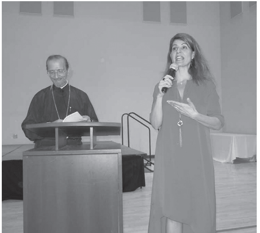
Nia Vardalos signing books at the Cathedral on June 9