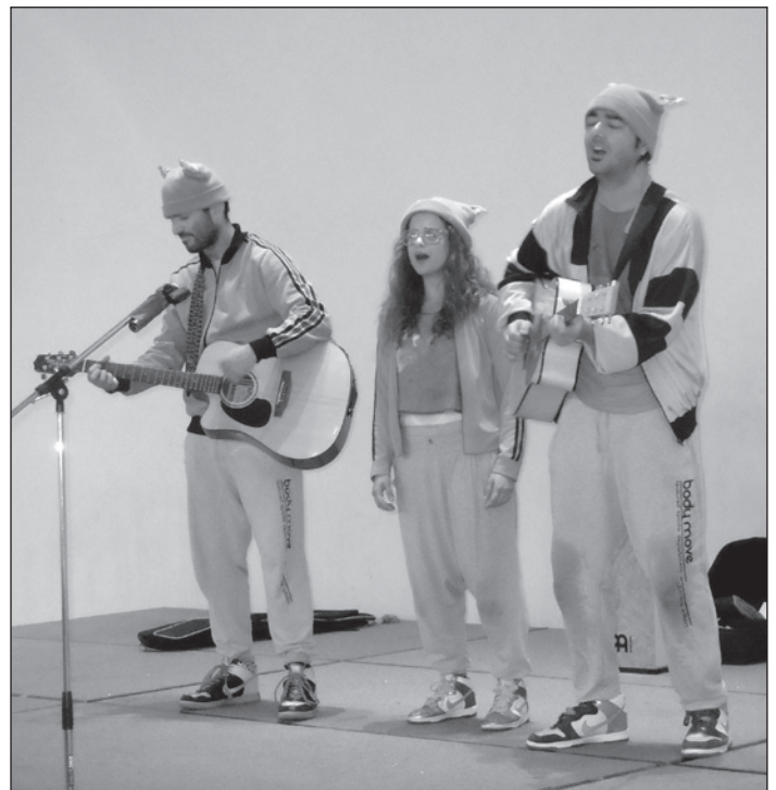
The story of 'Niaru' being performed on the final day of Greek School, June 8