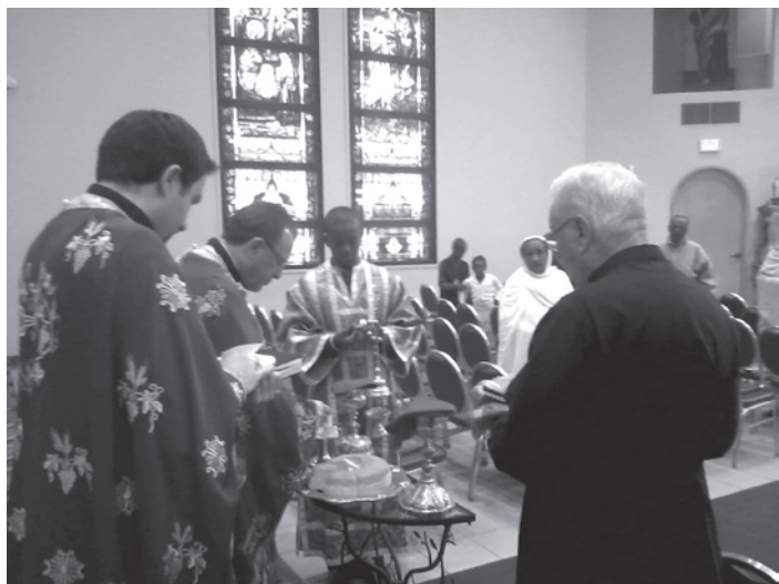
The teaching liturgy