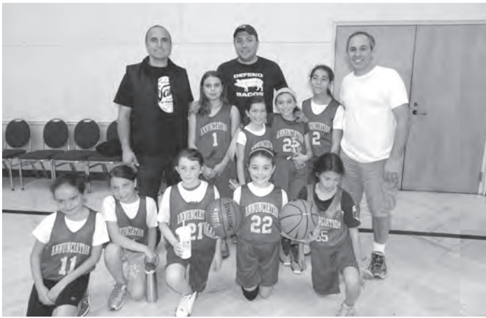
from page 5

ful tradition at Annunciation! Let's get everyone involved. Help needed: Volunteers to help with Angels are needed to facilitate the program.