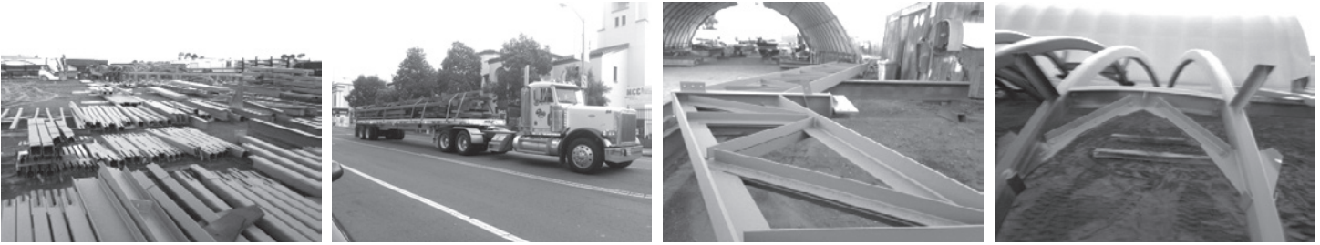
The first shipments of steel arriving to begin construction on the new Cathedral itself