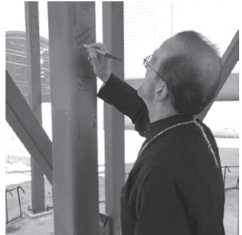
His Eminence Metropolitan Gerasimos signing the steel.