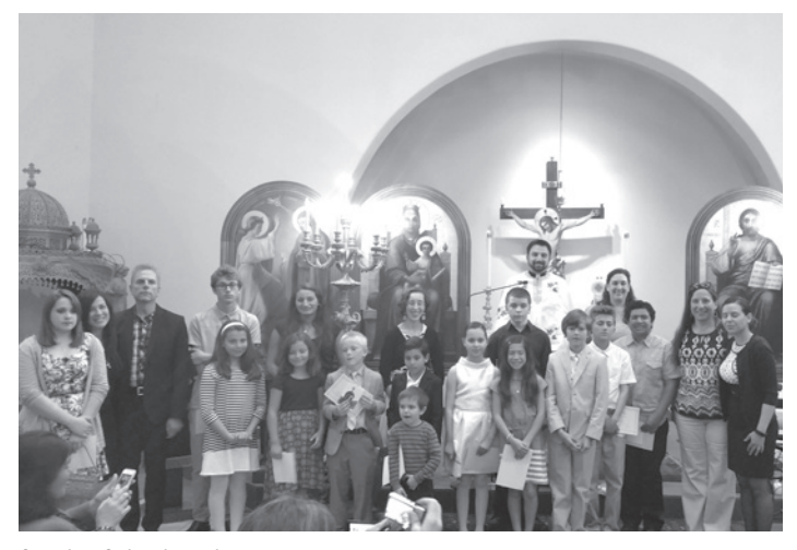
Sunday School graduation, June 7.