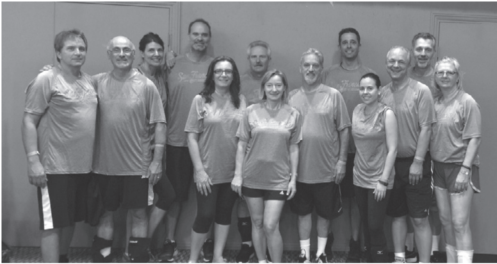
The Adult Team took 3rd and 4th place in the volleyball tournament