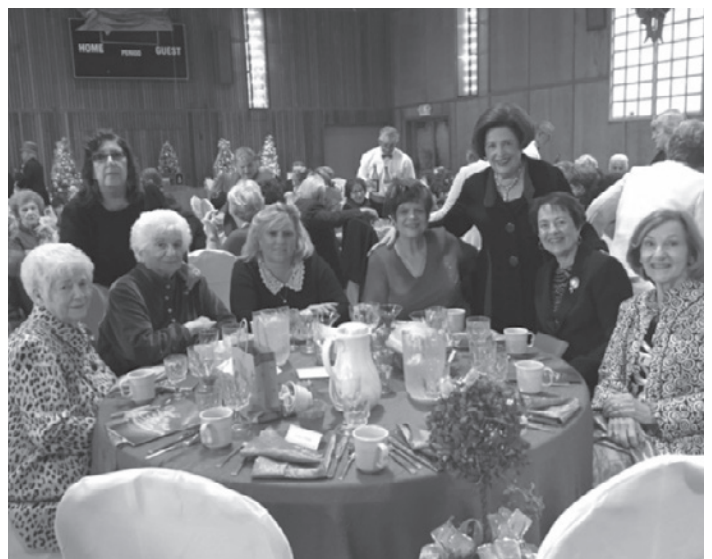
Some of the Cathedral Philoptochos members at the Luncheon