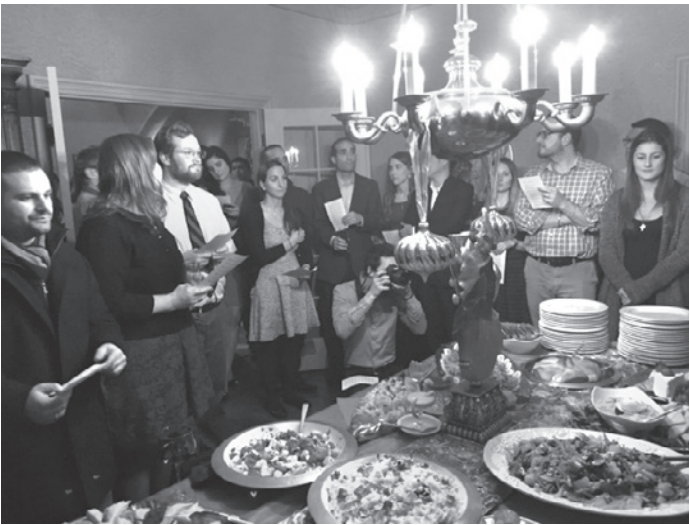
Some of the many Young Adults who attended the Christmas party at the Metropolis House on December 18.