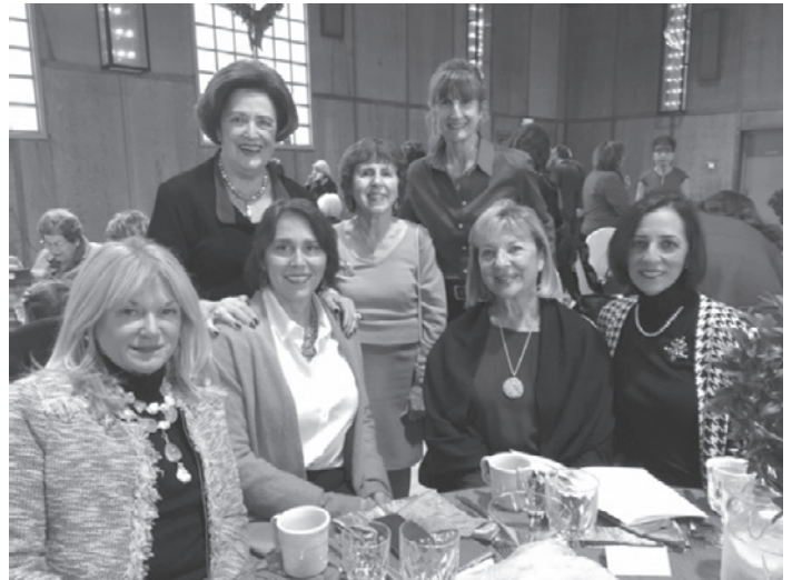
All smiles at the Luncheon December 12

Our Membership drive for 2016 will take place the months of January through March. We look forward to all becoming members of our hard working chapter. We are Philanthropy in action. Look for information that tells all the ministries we support.