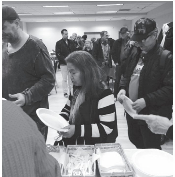
Some of our 50 guests at the December Soup Kitchen