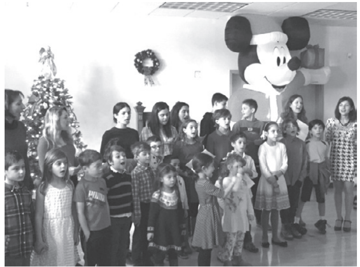
Children of the Cathedral's Greek School, singing the Kalanda during the Christmas program December 19.