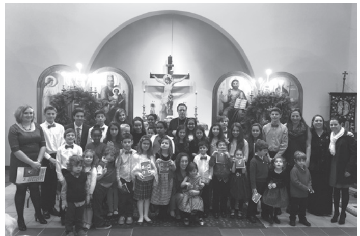
Children of the Cathedral's Sunday School, wishing everyone a Merry Christmas, during its Christmas program December 20.