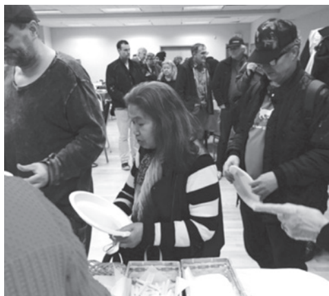
Some of our guests at the Soup Kitchen

learned more about this important ministry. The ministry takes time to shop, to cook, to serve. It involves set-up, take-down, and follow through. In addition to feeding the hungry, the Soup Kitchen ministry has a nurse on hand and gives each guest items to take with them—mostly canned or packaged food items, but items to help keep people warm during this increasingly cold time of year. Thank you, all for, in feeding and for reaching out to the hungry, you are feeding and reaching out to Christ Himself.