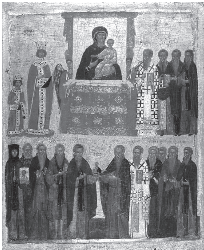
The above icon, referenced above, is known as the "Triumph of Orthodoxy." This event is celebrated in Orthodox Churches the first Sunday during the Great Lent. This year, the Sunday of Orthodoxy falls on March 20.

What this icon visually represents is the end of Byzantine iconoclasm and return of the primacy of the icon. As expressed, icons play a vital role in the practice of Orthodox faith. However, there