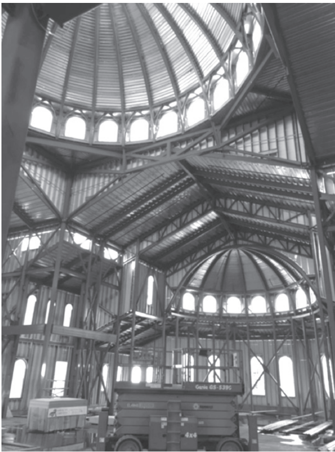
Taken on January 11, this photo shows the interior of the Cathedral, looking east. Fire sprinklers are being installed in the apse and in the dome and, soon, the remaining windows will be installed. The windows, crafted for the Cathedral by Pella, 135 in all, are metal on the outside and oiled walnut on the inside. Together with the mahogany details, they will provide warmth against the stone, steel, marble and concrete finishes.