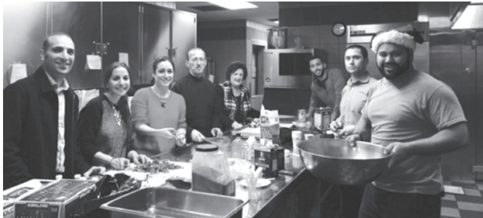
Some of the Soup Kitchen volunteers with His Eminence Metropolitan Gerasimos