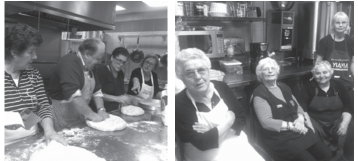
Baking the Vasilopita, in preparation for the Vasilopita cutting and brunch on January 10, sponsored by the Ladies Philoptochos. Now, let's see...that's 350 degrees, 45 minutes.

states of Oregon or Washington and we have been reassured that the quality is superb and as good as ever. You won't want to miss out so get your reservations in early and enjoy another night of delicious cuisine provided by our hardworking Philoptochos. Look for the flyer in the Herald and in the mail. Much of the proceeds will go to our ministries and to the Cathedral building fund.