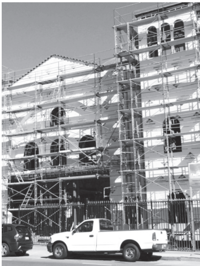
From the exterior, a little like the old Annunciation! Notice the windows and the central peak. Even the towers, for those who remember the bell towers before they were taken down in the 60s. In any case, the exterior is thoroughly Byzantine. It is typical of Orthodox churches built between the 4th and 9th centuries. The interior is something else. Like Orthodox worship itself, it must be experienced.