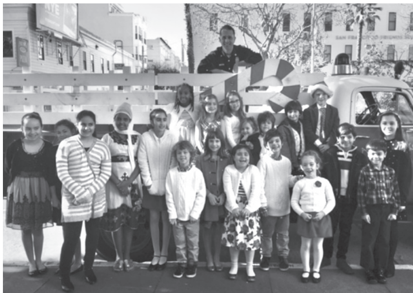
We participated in the SF Fire Department's Toy Drive