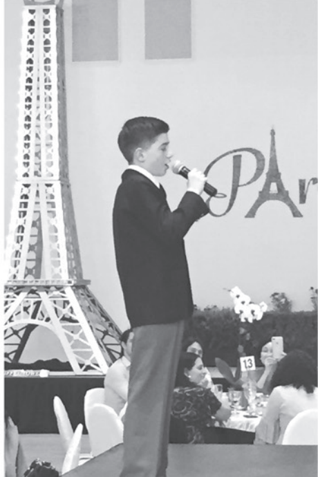
"I love Paris in the spring time..."