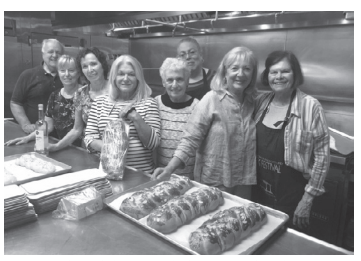
Some people said they were the best Easter breads ever! But, of course. Hand-made, by the best cooks ever! We are proud of our Philoptochos team. We thank them for their faith, their vision, and for their hard work.