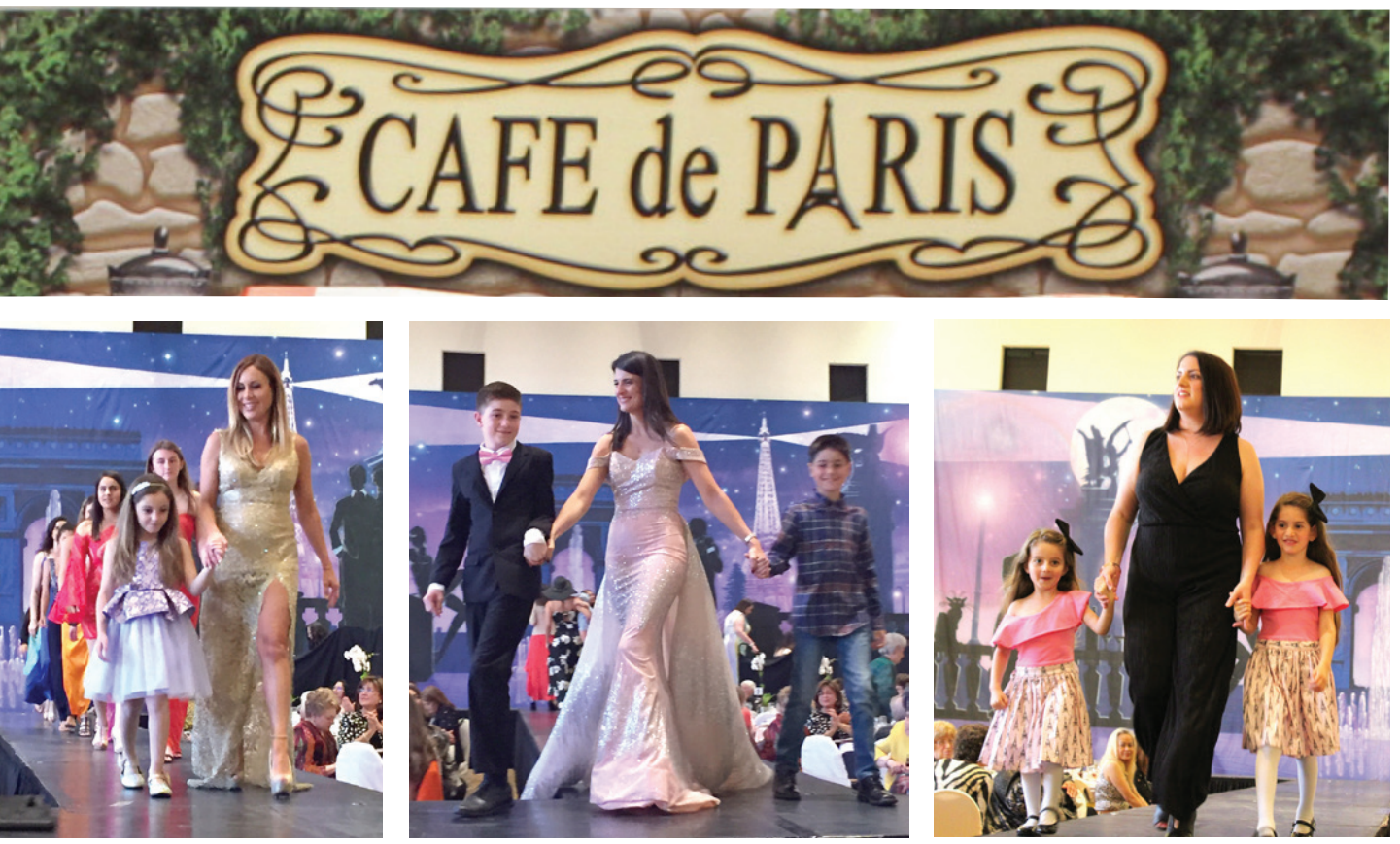
Efharisto for another outstanding Mother's Day Luncheon and Fashion Show. See you all in "London" next year.