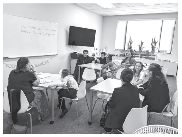
Our students learn by asking questions.