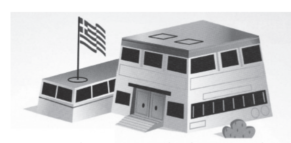
σχο-λεί-ο, το σχολείο, ένα σχολείο, το μεγάλο σχολείο, το σχολείο μου