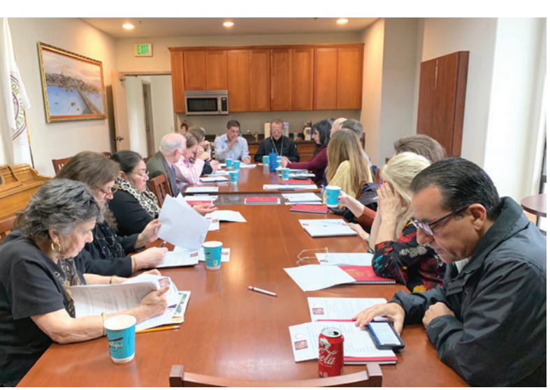
First 100<sup>th</sup> anniversary meeting. Many more to follow.