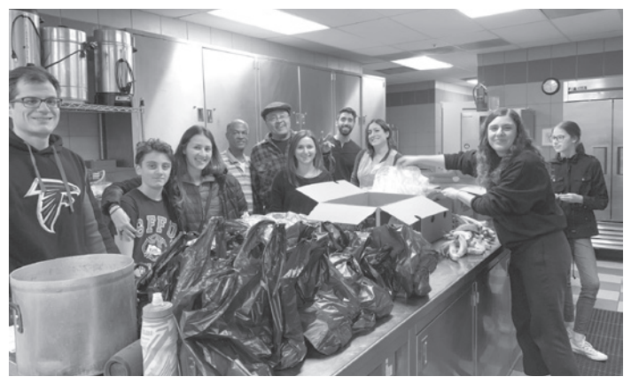
Members of Annunciation Cathedral's GOYA (Greek Orthodox Youth of America) prepare to-go bags at the December Community Kitchen. Some 130 guests were served a hot meal.

In February Community Kitchen will take place on Tuesday, February 18, 5:30 p.m. for set up and 6:30 p.m. for serving. We look forward to your participation.