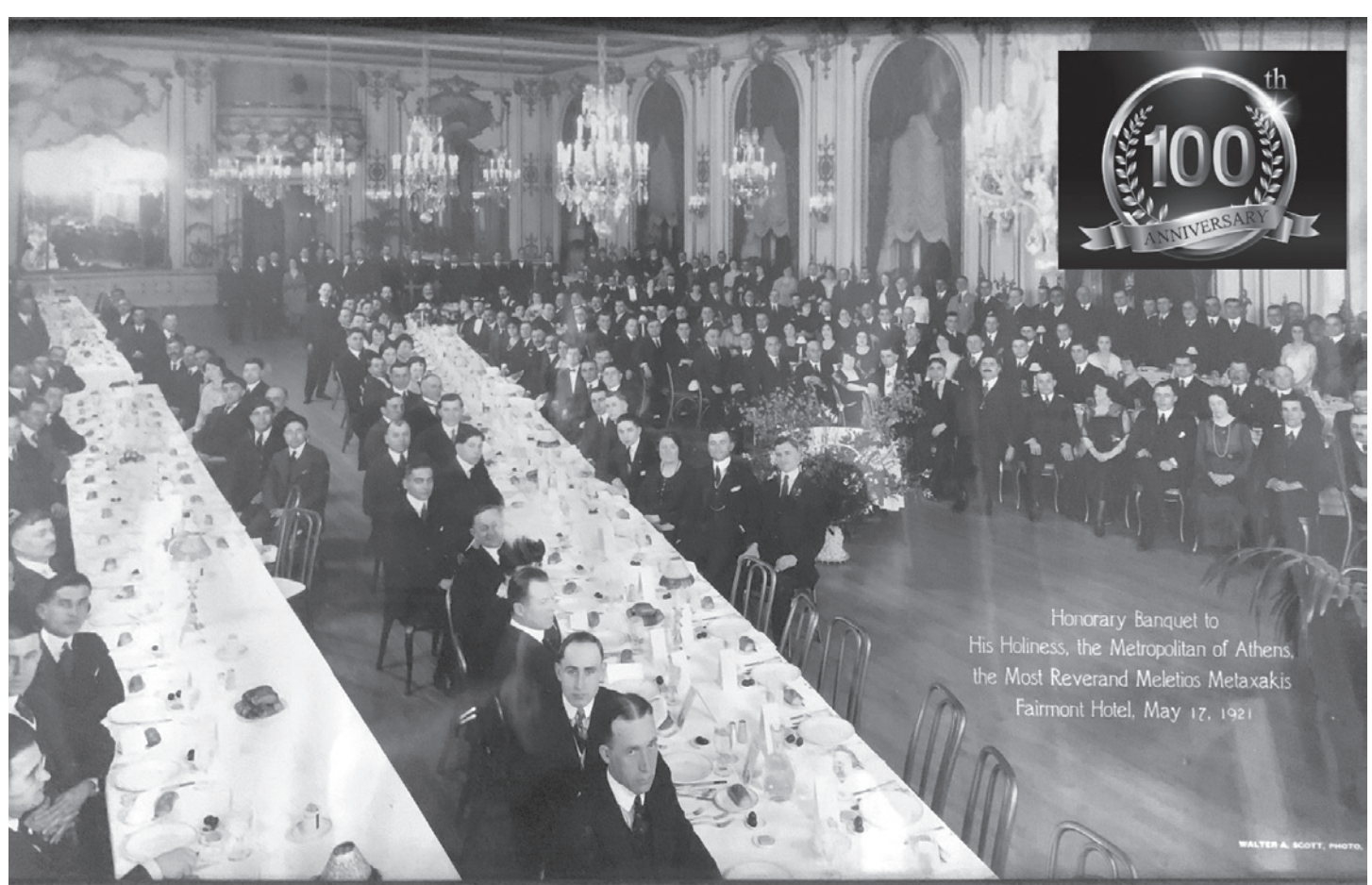
The above photograph was taken nearly 100 years ago, in the grand ballroom of San Francisco's Fairmont Hotel. It was taken on May 17, 1921. At this banquet, the Cathedral was created.