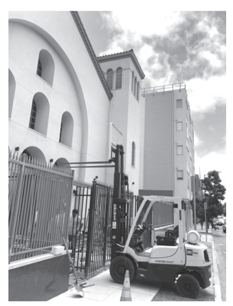
Building Update Things Are Beginning to Move

The present pandemic has put everything building-related on hold but, now, things are beginning to move again. The granite which along the Valencia Street walls and the stone cap have been installed. The roofing and drainage issues are being addressed as the present Herald went to press. The gate people have resumed installation of the Valencia Street Gates. We're now waiting for the lobby doors. They should be installed by mid-August. Then, the stone people will come out and complete laying the pavers, right up to the street. Finally, the elevator will become operational and the state inspector will certify its use. This can happen as soon as the latter part of August. As soon as we finish this and obtain our certificate of occupancy for the garage, we can open the garage to self-park. This is necessary if we are to open up the church, as the valet can guide us where to park, but can no longer park our cars for us. They will, instead, direct where we should park and oversee the operation of the lot. This is also necessary because it will provide income for the Cathedral, derived primarily from neighbors and others who wish to park in our lot, in accordance with our conditional use permit. Finally, we will be able to complete the engraving of the pavers in accordance with our Adopt a Paver Program. Some 100 pavers have been adopted to date.