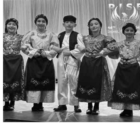
Rizes, our 7-9 year old group, performing on stage at this year's FDF.