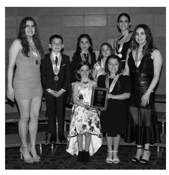
Rizes, 4th place medal, Primary category.