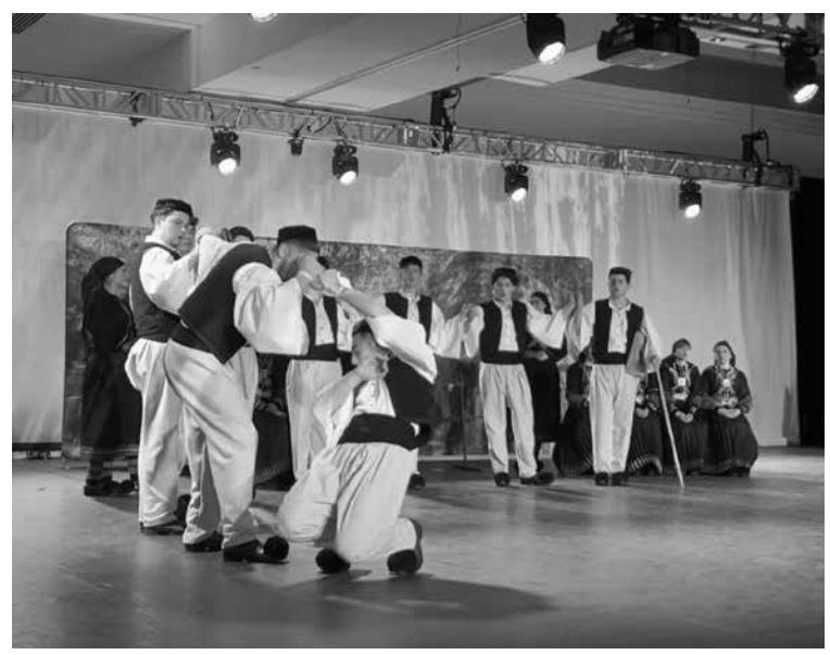
Spithes performing on stage at this year's FDF. Opa!