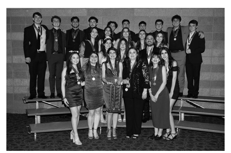
Spithes, Sweepstakes winners, all-around first place out of all 4 categories in Division I!