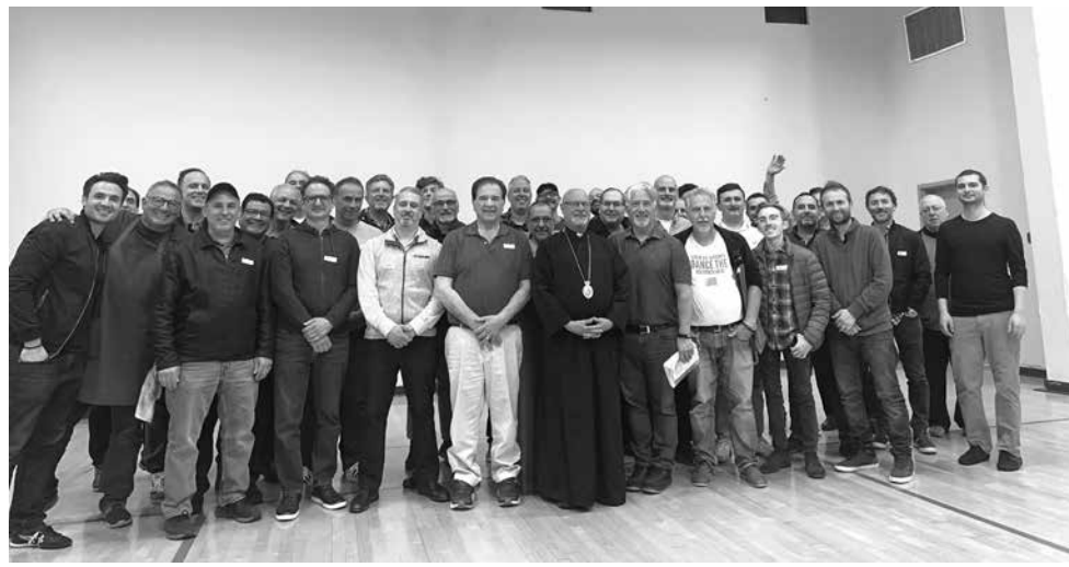
From page 3

This new ministry has generated a lot of excitement and enjoyment both spiritually and socially. Our gatherings will resume after the summer and we look forward to expanding it by inviting men from other parishes around the Bay Area.