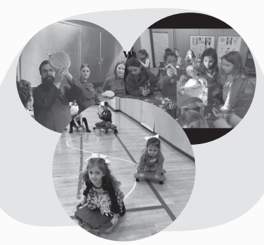
Register online at: annunciation.org/elpida-lenten-retreat or use the QR code below.

$50 per child. Will include donation of completed stuffie for SFPD, all curriculum materials, snacks and pizza dinner