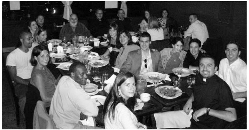
Young adults gathered for dinner on August 7, following the Paraklesis Service at the Cathedral.

The Gospel reading for September 1 is taken from Luke, chapter 4, verses 16-30. In this passage, Jesus begins His ministry by going to his hometown of Nazareth, where He reads a scroll containing the following prophesy of Isaiah: “The Spirit of the Lord is upon me, because He has anointed me to preach good news to the poor. He has sent Me to heal the brokenhearted, to proclaim release to the captives and recovery of sight to the blind, to set at liberty those who are oppressed, to proclaim the acceptable year of the Lord.” (Orthodox Study Bible) This passage is read as a reminder that every year is an “acceptable year of the Lord” as we set carry out the mission as delineated by our Lord—preaching good news to the poor, healing the brokenhearted, proclaiming release to the captives and recovery of sight to the blind, and setting at liberty those who are oppressed. As we “come together” as a community, to begin our schools, to celebrate our various events, including our Food Festival, as we undertake the task of building our church, let us so, mindful that we do everything in our Lord’s Name.