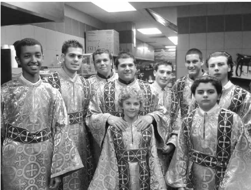
Cathedral GOYAns who serve as acolytes