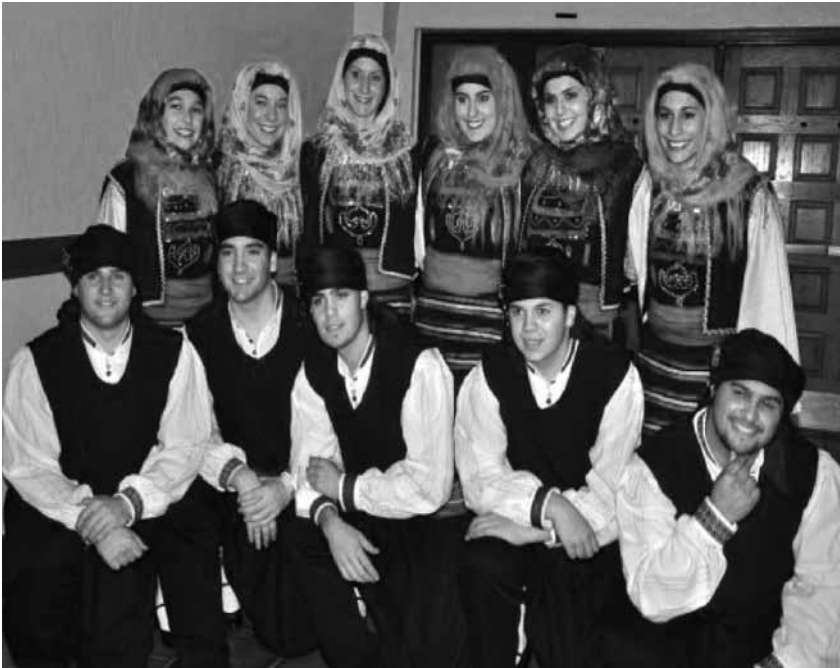
GOYAns as Greek folk dancers. Our senior dance group is in the process of being re-formed. Meanwhile, our youngest groups Thisavri and Spithes practice on Sundays. Ekrixi (ages 13-16) practices Tuesday evenings.

We thank each of these dedicated parents for volunteering their time this year to help the youth programs of our church and minister to the Lord's children!