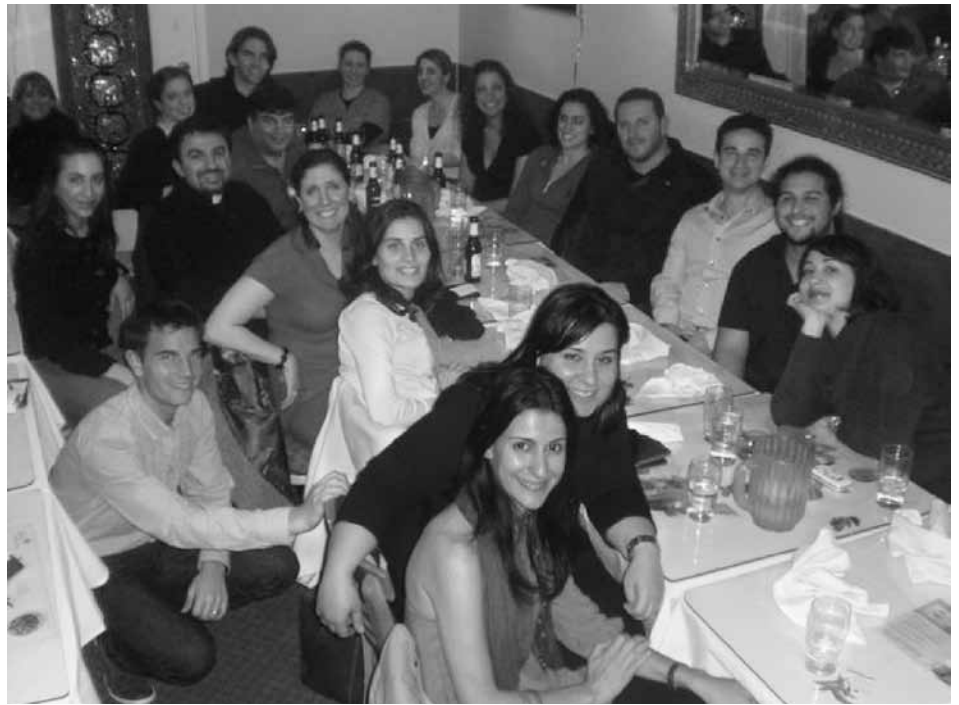
A recent young adult gathering

An Eritrean School has recently started operating, also on Saturdays. Eritrean School will also begin on Saturday, September 11. The particulars of this school were not available at the time of printing of the August Herald . They will be included in the September issue.