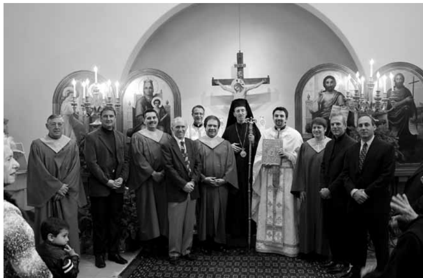
This year’s new members of the parish council taking the oath of office and being sworn in on January 8.

Please feel free to bring names of any loved ones who have passed on from this life, and kollyva for their memorial service, if you wish.