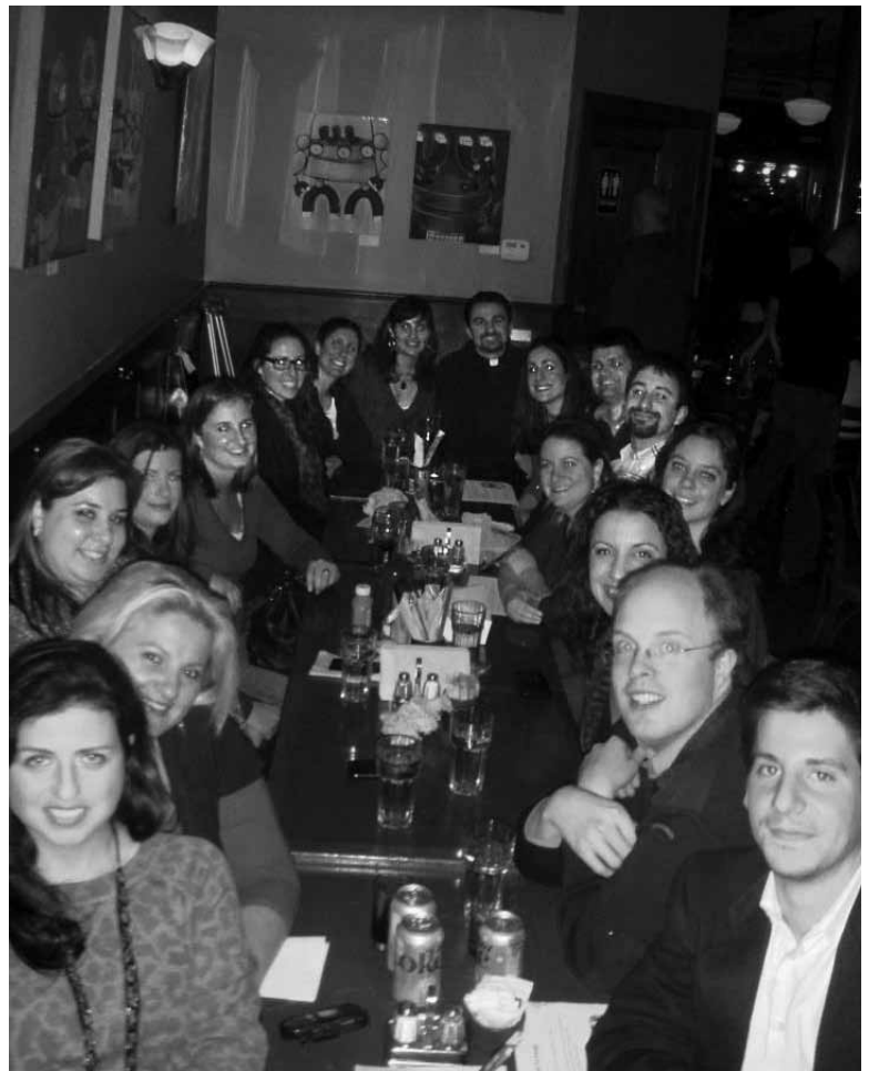
December 2011: Some of our young adults from their Kris Kringle Gift Exchange/Dinner in December