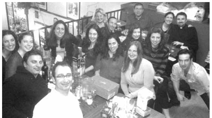
Our Cathedral Young Adults at our December Dinner and Gift Exchange at Dino's Pizza