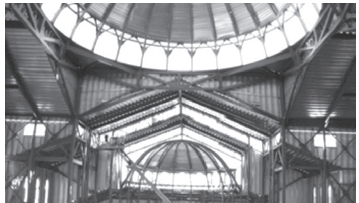
View from the new choir loft